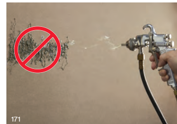
3M™ Cylinder Spray Adhesives do not atomize spray patterns with added airline. This means you get consistent even spray patterns, potentially saving rework and cleanup.