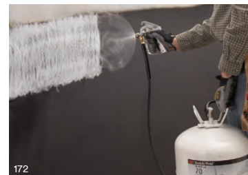
Consistent spray patterns and portable cylinders mean you can realize big improvements in efficiency and save time and labor costs.