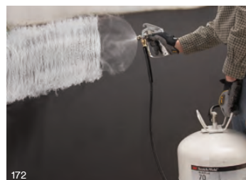
Consistent spray patterns and portable cylinders mean you can realize big improvements in efficiency and save time and labor costs.