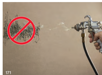
3M™ Cylinder Spray Adhesives do not atomize spray patterns with added airline. This means you get consistent even spray patterns, potentially saving rework and cleanup.